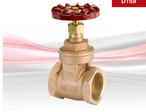
Please note: the photograph & dimensional drawing denotes sizes 1/2" - 2" only.